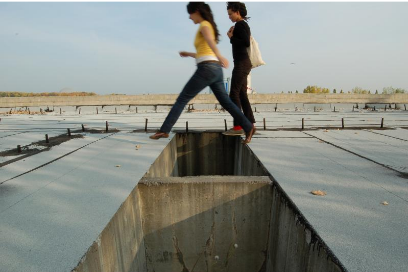
BorderXing by Kayle Brandon - Photos: HTMiles Festival 8 (2007) :: crowd control / contrôle des masses

20 YEARS OF FEMINIST PROPELLED DEBATE & EXPERIMENTATION WITH ART & TECHNOLOGY