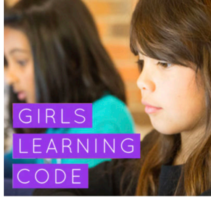
EDUCATIONAL ACTIVITY Girls Learning Code

An intervention of augmented reality in the public space: through 360 videos accessible by phone, the passerby can discover a series of virtual graffiti on the walls of Plateau-Mont-Royal's buildings, while listening to stories shared by refugees. Facebook event