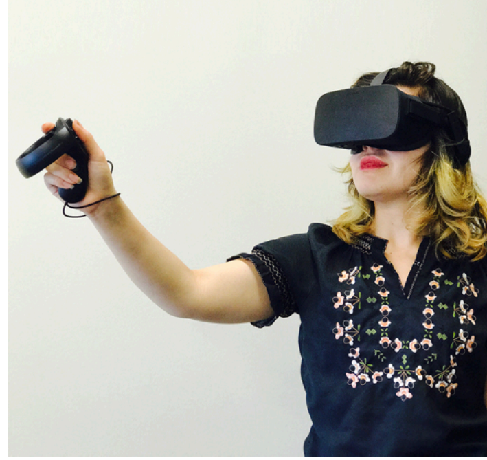
WORKSHOP Introduction to virtual reality with Casa Rara

Bring a special girl (between 8 and 13) in your life to this workshop and learn to create a website together from scratch! Girls will learn HTML and CSS basics by hacking pre-existing text, links, images, and videos on various templates, and then use their skills to create their very own fun business website. Facebook event