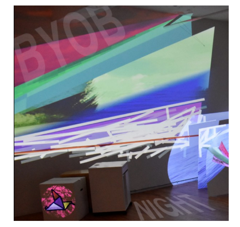
EVENT BYOB (Bring Your Own Beamer) Night

and videocalling. To register, contact ateliers@studioxx.org