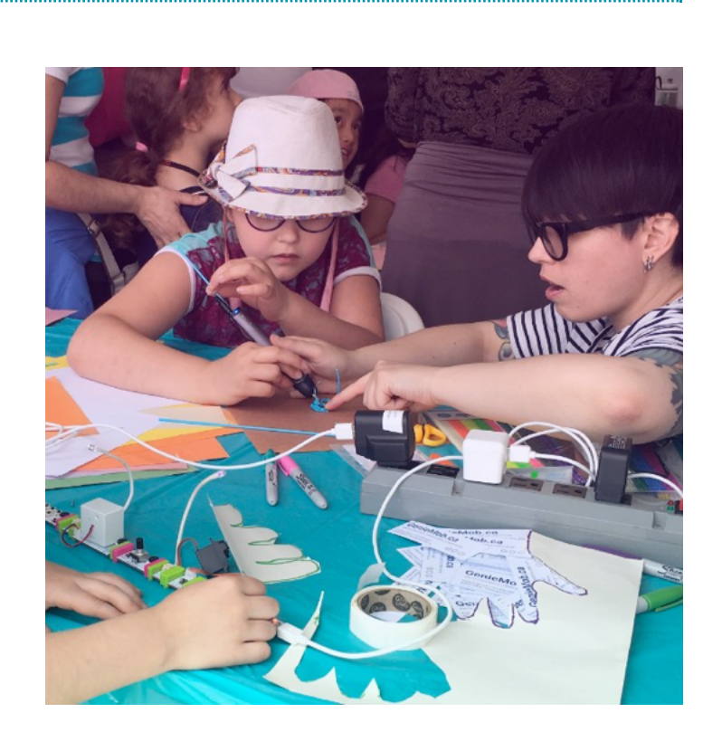
EDUCATIONAL ACTIVITIES Mediatic Arts for Families, Sound Hacking and Djing

To register: send the name and age of the participants to mediation@studioxx.org